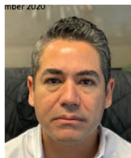
Returned to Durban, Natal