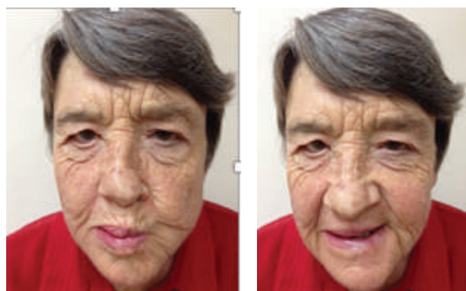
This patient achieved an improvement that gave her confidence to socialize in public.