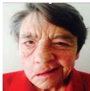
With permission from the patient

The condition was so severe that it was incumbent upon the physiotherapist to employ all possible treatments available to improve the condition.